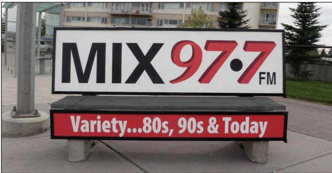
Transit Bench 2.0's are printed on a durable expanded pvc substrate and surrounded by a black heavy duty metal frame.